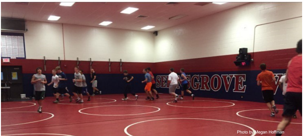
The first day of wrestling practice saw the small, but powerful, squad conditioning in the mat room

The first home match will be against Central Mountain in the high school gym, at 7pm, on December 14.