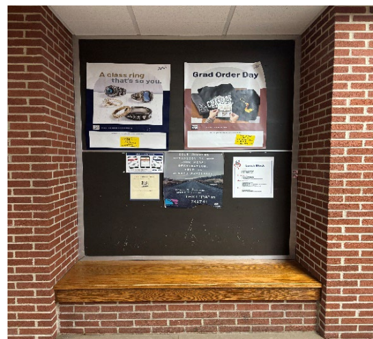
Media Center alcove for memorabilia and keepsakes

Hope to see everyone at one of our events this year. Please spread the word!